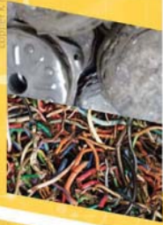
Copper & Fe

Leading Separation: Magnet+Sensor Sorting Solutions