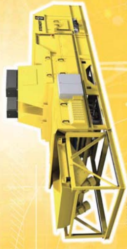
Copper & Fe